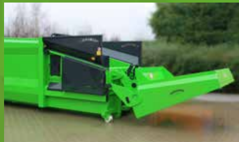
EMPTIES COMPLETELY. Convenient operation of the tipping function via the control panel – no material falls outside.