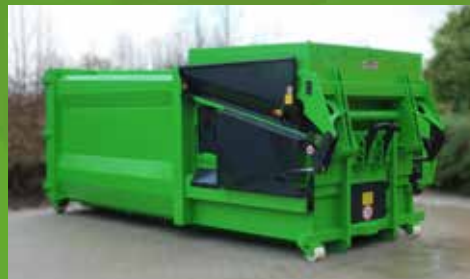
COVER FUNCTION. In transport position, the feed opening is fully closed.