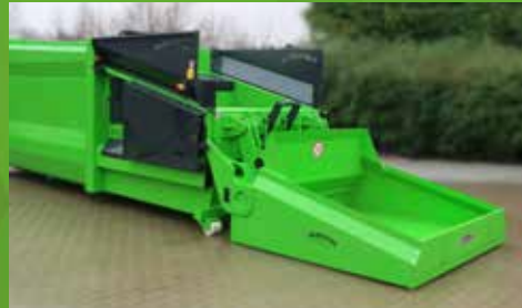
GROUND LEVEL. Loading without a ramp – loose material can be transferred easily.